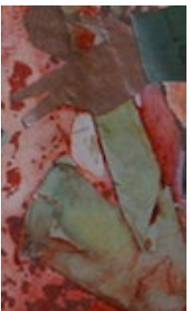
Guitar Magic, 1986 Romare Bearden